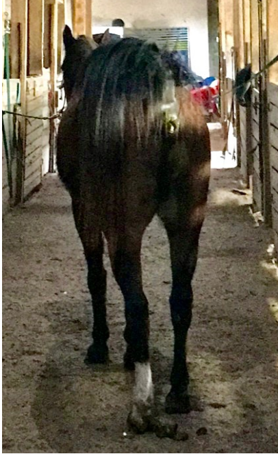
Figure 5: Defecating tail side on the left.

Refers to the side the tail was lifted when the horse defecated (Figure 5). This behaviour could be demonstrated to the left, right, or center relative to the horse's midline. Each individual defecation was recorded as a separate occurrence.