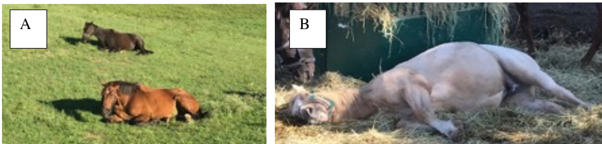
Figure 6: A) Lying down on the right to a half lying position and B) lying down right to a fully horizontal position (right).

Refers to the side of the horse that touched the ground first when a horse lowered itself to the ground. This behaviour was recorded anytime the horse laid down, irrespective of the behaviours after the horse touched the ground. However, these subsequent behaviours included, 1) half lying down with its head raised (Figure 6A), 2) lying down fully horizontal with its head on the ground (Figure 6B), or 3) lying down before a rolling bout. Once the horse had stood up, then a separate occurrence was recorded.