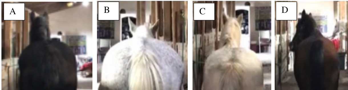
Figure 9: A) Initial ears forward position on cross ties, B) right ear backwards, C) both ears backwards, D) left head turn.