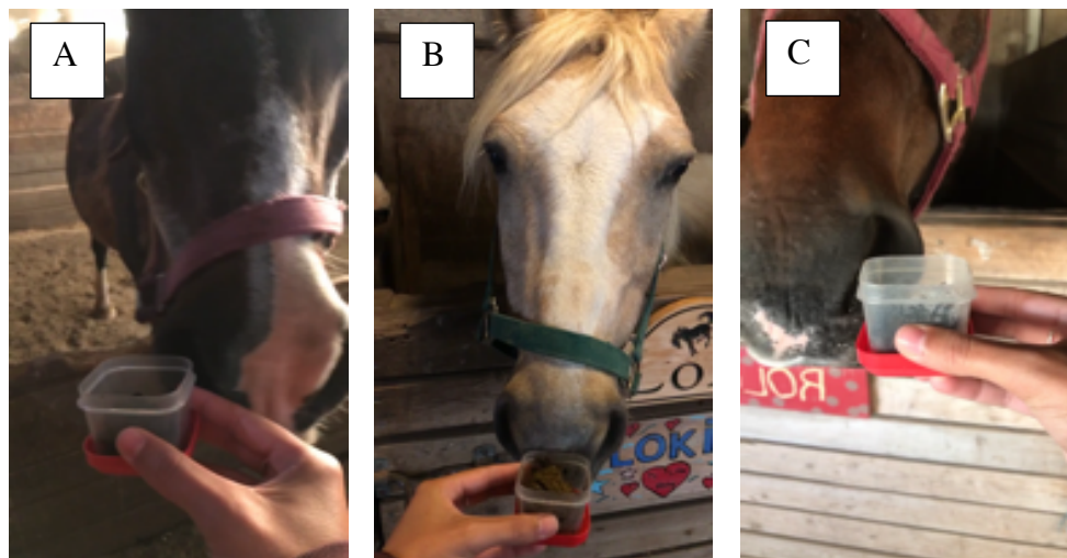
Figure 10: A) Left nostril, B) no side, and C) right nostril found during olfactory responses.

Small cube-shaped plastic containers (4cm x 4cm x 4cm) were used to present each of 3 different fecal odors: 1) unknown stallion, 2) unknown mare, 3) sheep. The container was filled with approximately 15 millilitres of freshly collected fecal sample and was presented to the midline of the horse about 2 centimeters from the horse's nose. The horses were presented with each odor sample for a total of 9 times, with no more than 2 odors presented in a random order per day. The odors were presented every two days to avoid the horses becoming accustomed to them. The hand that was used to present the sample was rotated in order to not influence the results. The side of the nostril that was used to first inspect the odor sample was recorded. Results were recorded as either left nostril, no nostril side, or right nostril (Figure 10).