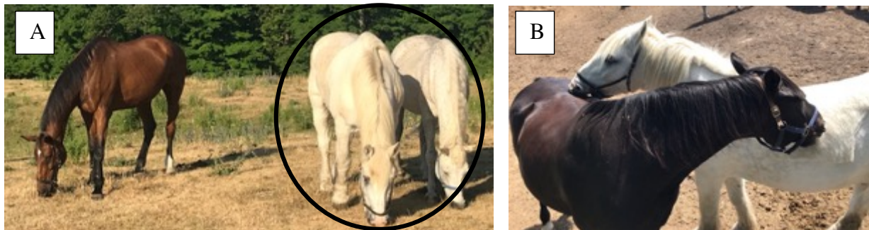
Figure 8: Affiliative interactions: A) White horses standing close as indicated on the picture and B) white horse is allogrooming on the left.

individual that was being groomed (Figure 8B). Once the horse had stopped grooming for a 10 second period, then a separate occurrence was recorded.