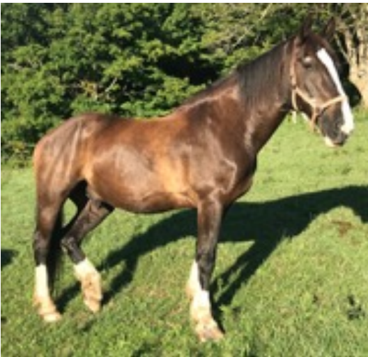
Figure 3: Flexing with left hindlimb.

Refers to the hindlimb which was protracted during grazing or standing (Figure 3). A separate occurrence was recorded after the horse had taken a few steps in order to allow it to readjust.