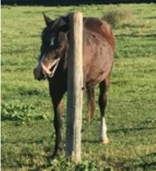
Figure 7: left-sided rubbing on substrate.

Refers to the side of the horse that was pressed up and rubbed against a substrate or another individual (Figure 7). Once the horse had stopped rubbing for a 10 second period, then a separate occurrence was recorded.