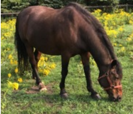
Figure 2: Standing with left leg forward.

Refers to the forelimb that was placed at least 30 centimeters in front of the other forelimb while grazing or standing (Wells and Blanche, 2008; Figure 2). 30 centimeters was chosen based on other studies and it represents an advanced stance compared to standing square. A separate occurrence was recorded after the horse had taken a few steps in order to allow it to readjust.