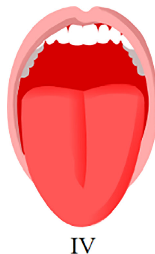
FIGURE A2 Modified Mallampati index IV, (from Wikimedia Commons, the free media repository)