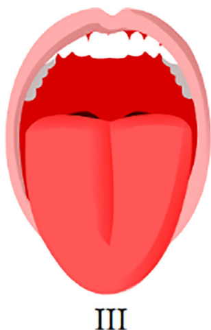
FIGURE A1 Modified Mallampati index III