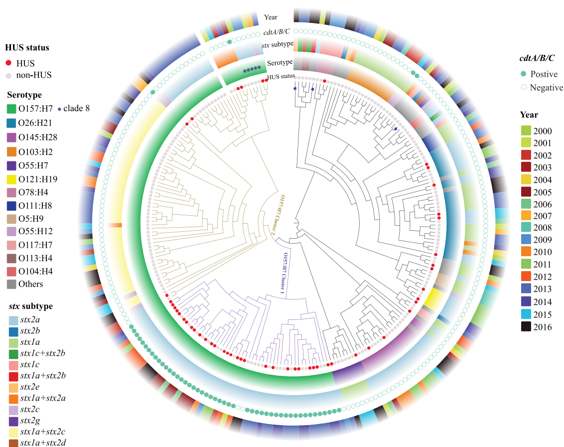
FIG 1 Whole-genome phylogeny of Shiga toxin-producing Escherichia coli (STEC) isolates. Circular representation of the Gubbins phylogenetic tree generated from the concatenated sequences of the shared loci found in the wgMLST analysis. Gubbins tree was annotated with relevant metadata using an online tool ChiPlot ( https://www.chiplot.online/ ). Circles (from inner to outer circle) represent HUS status, serotype (O157:H7 clade 8), stx subtype, presence of cdtA/cdtB/cdtC genes, and year of isolation. Three STEC isolates carrying heat-stable enterotoxin encoding gene sta are marked with blue stars on corresponding branches. Branch lengths are ignored to better illustrate the two O157:H7 clusters.

correspondence analysis (MCA) of pangenomes could not separate HUS STEC strains from non-HUS STEC strains, and O157:H7 strains were separated from non-O157 strains (Fig. 2), similar to whole-genome phylogeny. A PWAS was further performed on 52 HUS STEC strains to identify any accessory gene associated with risk factors for poor renal outcome among HUS patients. Scoary identified a number of accessory genes that were associated with the need for and longer duration of dialysis, presence and longer duration of anuria, and higher leukocyte count; however, most of these genes encode hypothetical proteins, and all associations lost statistical significance after multiple testing correction (data not shown). MCA of pangenomes could not separate HUS STEC strains into subgroups based on clinical variables of HUS patients assessed in this study; O157:H7 HUS STEC strains formed a separate cluster from non-O157 strains by MCA (data not shown).