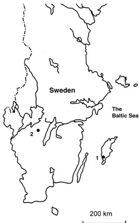
Figure 1. Map of Southern and Central Sweden showing the two archaeological sites referred to, 1. Gökhem, 2. Ajvide. doi:10.1371/journal.pone.0002316.g001

We selected seven of the 74 human samples that had yielded significantly more human mitochondrial DNA ( >1264 copies/5 \mu l extract) than the non-human samples ( <197 copies/5 \mu l extract) (Fig. 2, Tab. 1), so that these human samples contained on average 198 times more human copies of the mitochondrial fragment tested for ( 3951 \pm 1296 SE) than the 29 non-human