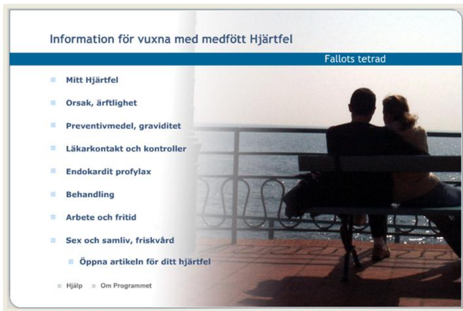
Picture 2: The main areas in the Computer-based Educational Program.